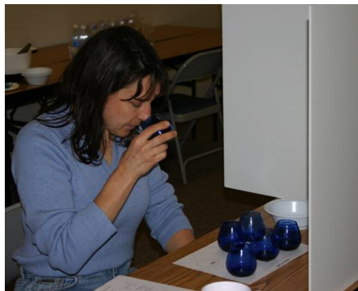
A secluded taste panel member evaluating oils in silence

problems. Olive oil should have a fruity olive flavor that is characteristic of the variety or blend of varieties making up the oil. There should be no vinegary or fermented odor or flavor. The oil should also not be rancid or possess any other off flavor that is essentially not of the olive. The second objective of oil-sensory evaluation is to describe the positive characteristics of the oil in relation to its intensity of olive-fruity character. Bitterness and pungency are often present in olive oils, especially when newly made. They are not defects and will mellow as the oils age.