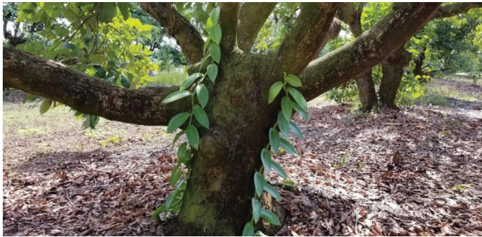
Figure 6. V. pompona growing on an avocado tree. Vines were received as 1-meter-long cuttings. Growth is after one year without supplemental irrigation.

Vanilla vines require trellising to maximize production. Two major production methods are used. One uses “tutor” trees to provide both shade and a suitable structure on which the vines can climb. Tutor trees can be selected based on hardiness in a given location, availability, and co-cultivation considerations. This type of cultivation can be less expensive in some areas and naturally reduces the risk of vine death by Fusarium by increasing the distance between plants. Growers in southern Florida could consider vanilla as a secondary crop on existing fruit trees. Figure 6 shows V. pompona growing on an avocado tree. Any agricultural inputs will have to be compatible with both species under the intercropping model.