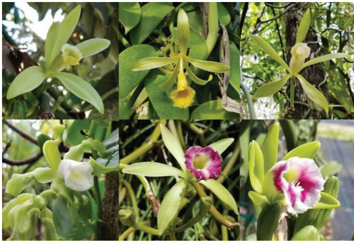
Figure 1. Flowers of V. planifolia (top left), V. pompona (top center), V. phaeantha (top right), V. mexicana (bottom left), V. dilloniana (bottom center), and V. barbellata (bottom right) growing in southern Florida.

Florida has four native vanilla species: V. barbellata , V. dilloniana , V. phaeantha , and V. mexicana . The species V. planifolia is naturalized (Figure 1), and V. pompona is also common among gardens in southern Florida. The native Florida vanilla species are endangered and should not be collected from natural areas without proper authorization and permitting by regulatory authorities. Puerto Rico has six species growing wild: V. barbellata , V. dilloniana , V. poitaei , V. pompona , V. claviculata , and V. planifolia .