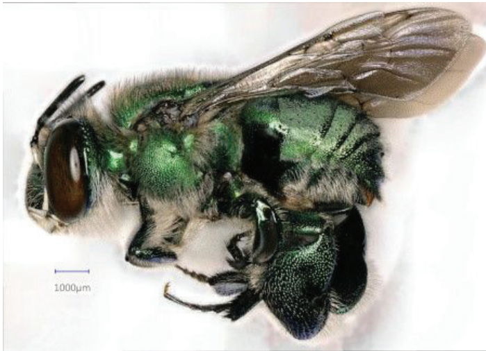
Figure 2. Euglossa dilemma lured and captured at the UF/IFAS Tropical Research and Education Center. This bee could be a pollinator of vanilla orchids.

Auto-pollination of V. planifolia flowers is rare to nonexistent in regions where native pollinators (bees and perhaps hummingbirds) do not occur. Though not native, the orchid bee Euglossa dilemma (Figure 2) has become established in southern Florida and could potentially be a pollinator of vanilla orchids. In parts of Mexico and Florida, pollination has been observed in natural areas without human intervention (Figure 3). One hypothesis is that Euglossa dilemma , or an unidentified native orchid pollinator in southern Florida, could be pollinating the Vanilla flowers, reducing the need for manual pollination.