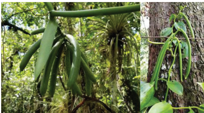
Figure 3. Bean development in the absence of manual pollination for V. phaeantha (left) and V. mexicana (right) in natural areas.