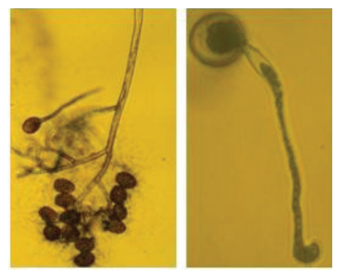
Figure 4. Microscopic mount of a) down-hanging aseptate sporangiophore of Peronospora belbahrii and b) germinating sporangium of the basil downy mildew pathogen.