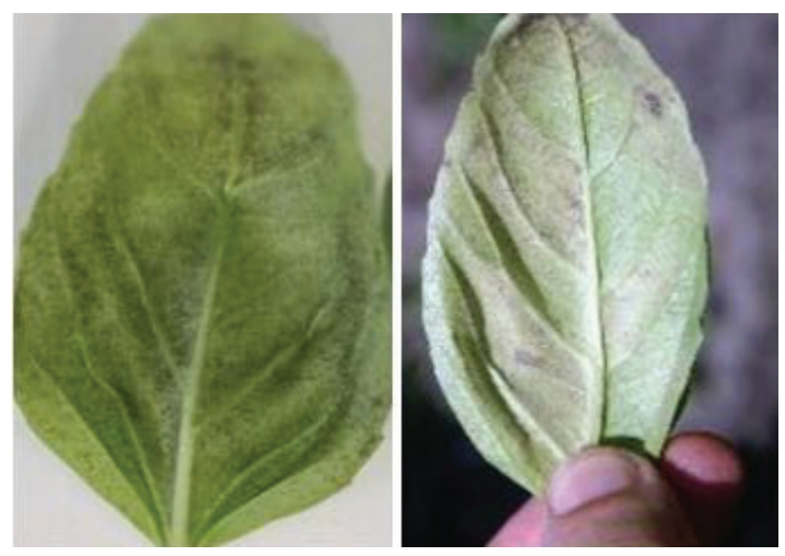
Figure 3. Sporulation evident on underside of the basil leaf.