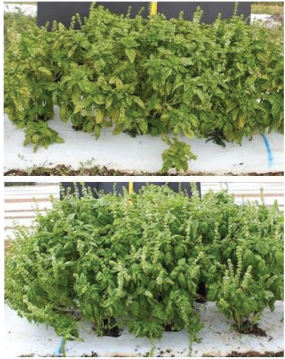
Figure 1. Symptoms of downy mildew on field-grown basil (top) compared with healthy basil plants (bottom).

leaf surface and chlorosis of the adaxial (upper) leaf surface make basil leaves unacceptable for the marketplace.