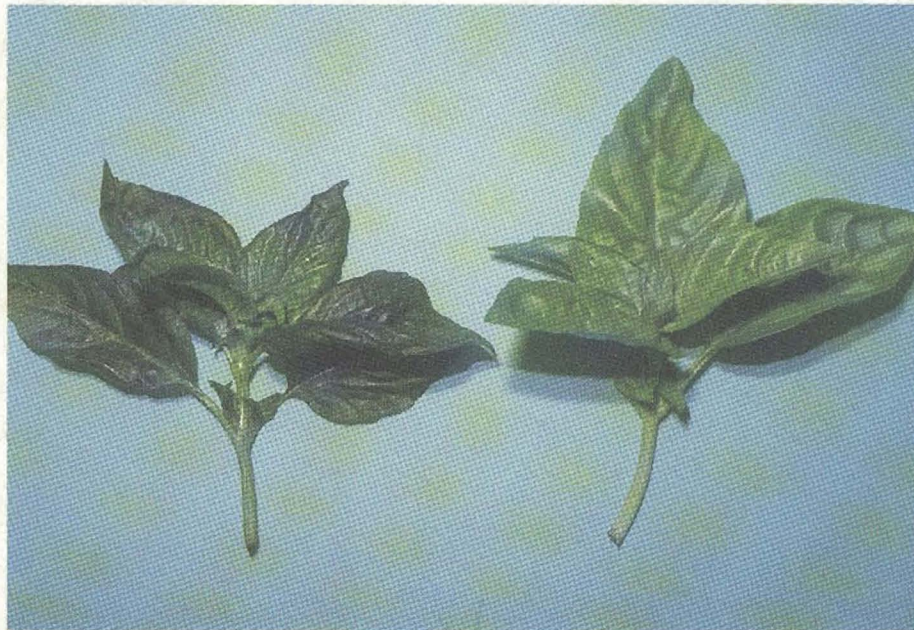
Figure 7. Chilling injury of harvested basil.

Fresh basil is very tender and is easily damaged by rough handling, desiccation, and chilling. To ensure and maintain product quality, minimize bruising when har-