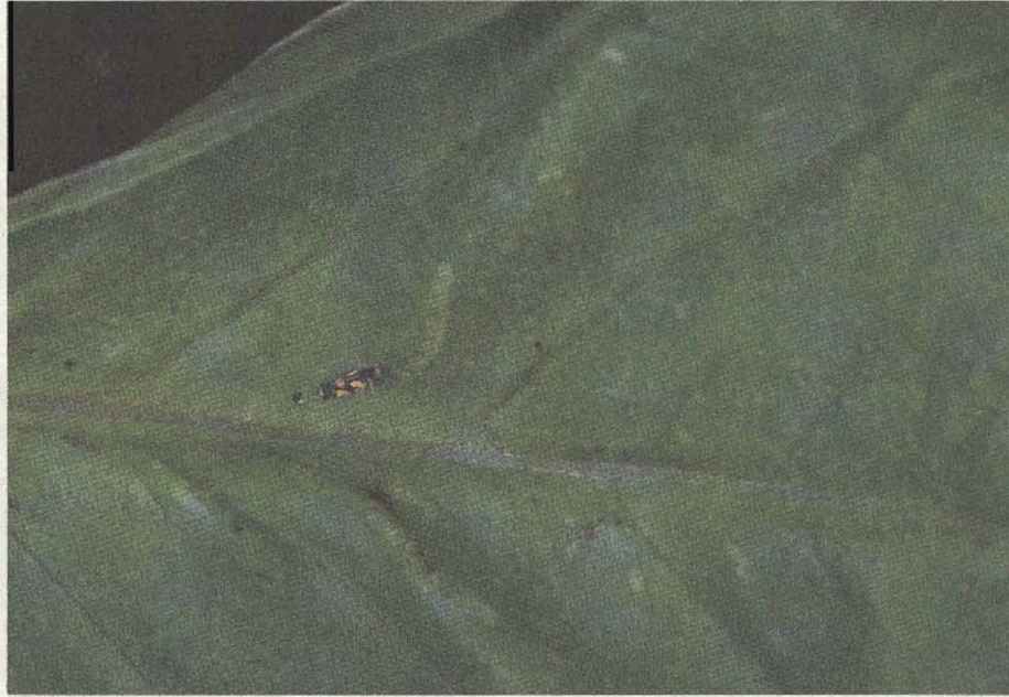
Figure 3. Brazilian leafhopper damage to basil.

and cause significant problems on basil grown for export. Thrips are small, slender insects which generally have wings with hair-like fringes in the adult stage. Banded greenhouse thrips are very common on basil and can usually be found on the lower leaves of established plants. Their feeding leaves whitish scars or a silvered appearance on the leaves. The fecal spotting left by thrips is also noticeable. Live thrips in harvested basil can be easily overlooked because of their small size and cryptic habits. Since it is difficult to identify immature thrips to the species level, the presence of live thrips in basil shipments has been of great concern to the local fresh herb export industry.