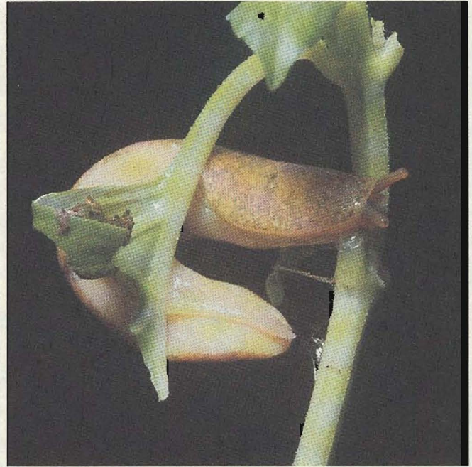
Figure 2. Slug damage to basil.

Pink winged grasshopper , Atractomorpha sinensis Bolivar. Basil may be attacked by several grasshopper species. The pink winged grasshopper