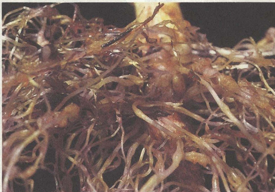
Figure 6. Damage to basil by root-knot nematode.

Unhealthy fields produce leaves of poor to marginal quality. Leaves harvested from fields with disease problems are rapidly rotted by bacterial and fungal pathogens following packing. A minor field problem involving low levels of bacteria can result in major postharvest losses. Avoid harvesting from fields where bacterial pathogens are known to be present. Select clean leaves only from the tips and avoid branches near the base of