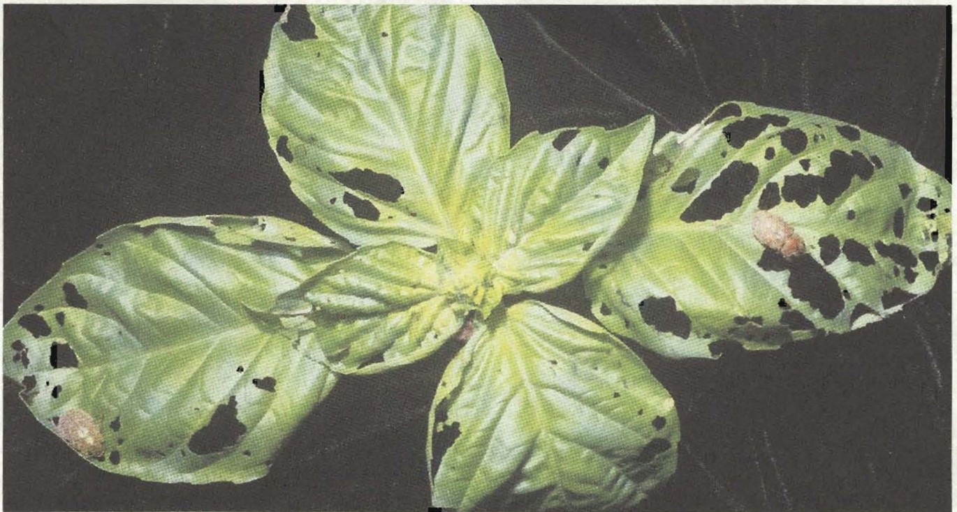
Figure 1. Chinese rose beetle damage to basil.

Chinese rose beetle, Adoretus sinicus Burmeister. Chinese rose beetles cause heavy damage to basil when population levels are high. Adult Chinese rose beetles are brown, about \frac{1}{2} in long, and are nocturnal. The chewing-type damage may appear as leaves with holes or with a lace-like appearance when the areas between leaf veins are eaten (Figure 1). Chinese rose beetles