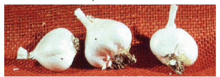
Figure 1. Garlic bulbs

Garlic must be well dried and cured after harvest before being stored. This can be accomplished outdoors if no rain occurs or indoors in a dry shed.