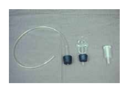
4. Fermentation lock