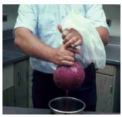
Step 10 - Fermenting Red Wine