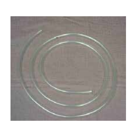
6. Siphoning unit