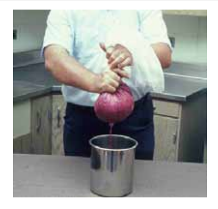
10. Pressing bag or straining cloth