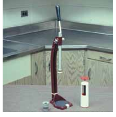
8. Wooden hand corker