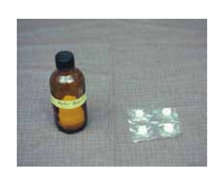
7. Campden tablets or potassium metabisulfite