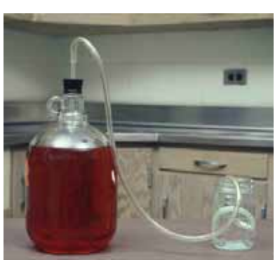
Step 14 - Bottling the Wine