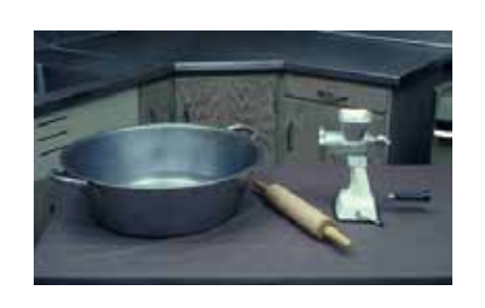
1. Rolling pin, or food grinder, or food chopper