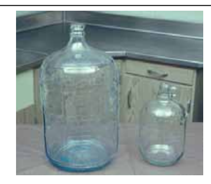
3. Secondary fermentor