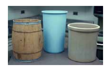
2. Primary fermentor