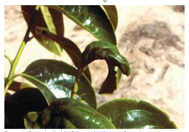
Figure 2. Central rolled leaf shows the damage from the persimmon psylla.

Persimmon psylla is the primary leaf pest and is found attacking newly forming leaves in spring. Infested leaves appear crinkled and malformed (Figure 2). The white powdery covered nymphs and black bodied adults are found feeding inside the mishapen leaves which makes control difficult. Psylla infestations stunt the growth of shoots on young trees. Control with conventional pesticides should be timed to the bloom stage.