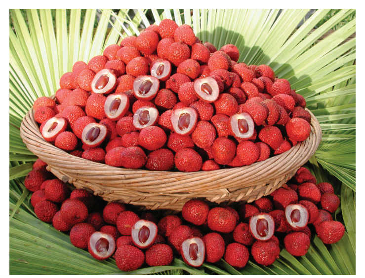
Figure 1. 'Brewster' lychee fruit.

Production: Lychee are grown commercially in many subtropical areas such as Australia, Brazil, southeast China, India, Indonesia, Israel, Madagascar, Malaysia, Mauritius, Mexico, Mynamar, Pakistan, South Africa, Taiwan, Thailand, Vietnam, and the US (Florida, Hawaii, and California).