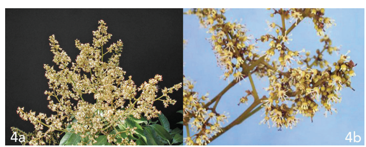
Figure 4. 4a) Lychee inflorescence in full bloom; 4b) Lychee inflorescence in full bloom.

Flowers are small, greenish, and are borne on a large thyrse (a many-flowered inflorescence) that emerges at the ends of branches anytime from late December to April (more commonly February and March) in Florida (Figures 4a and 4b). There are three flower types: two male types (called M1 and M2) and one female (called F). In general, the M1 flowers open first, female flowers (F) open second, and M2 flowers open third.