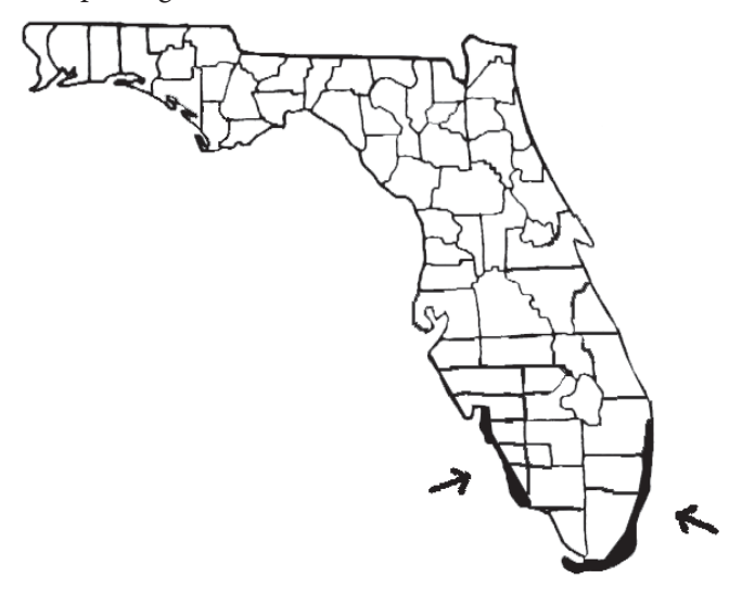
Figure 7. Florida map with dark areas along coast and arrows indicating where lychee may be grown.

The lychee has more cold tolerance than mango but less than sweet orange, so plantings are limited to coastal areas in southern Florida (Figure 7). Young trees are damaged at temperatures of 28° to 32°F (-2° to 0°C), while temperatures down to 24° to 25°F (-3° to -4°C) cause extensive damage or death to large trees if exposed for several hours. Lychee trees do not acclimate to cold temperatures after exposure to cool, nonfreezing temperatures. Symptoms of cold damage include leaf death, leaf drop, stem and limb dieback, bark splitting, and tree death.