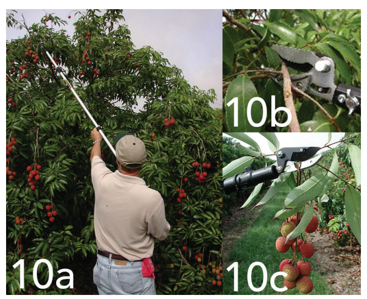
Figure 9. 10a) Harvest pole aid; 10b) Close-up of harvest aid with cutting edge and clamp; and 10c) Close-up of harvest pole aid and clipped fruit.

Fruit are harvested by cutting the main stem bearing the fruit clusters several inches behind the fruit clusters (Figure 9). Fruit may or may not be detached from the fruit clusters before storage. Ripe fruit are sweet, plump, and of the size and color characteristic of the cultivar (Table 1). Fruit picked while immature are not sweet and have poor flavor.