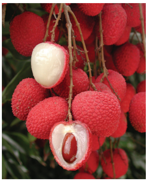
Figure 5. Lychee Fruit. 'Brewster' lychee fruit.

The fruit is a drupe and fruit are borne in loose clusters numbering from 3 to 50 fruits and are round to oval and 1.0 to 1.5 inches (25 to 38 mm) in diameter (Figures 1 and 5). The skin (pericarp) ranges from yellow to pinkish or red and is leathery, with small, short, conical or rounded protuberances. The edible portion of the fruit (pulp) is called an aril that is succulent, whitish, translucent, with excellent subacid flavor. Fruits contain one shiny, dark brown seed, usually relatively large, but it may be small and shriveled (called chicken tongues) in some varieties. Fruit must be ripened on the tree for best flavor.