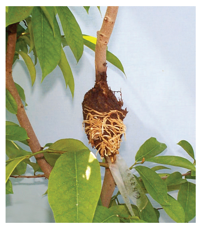
Figure 8. Air layering on a lychee tree.